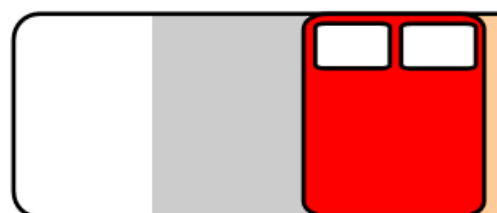
Toyota Hilux Double Cab